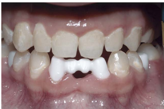
Fig. 5. Trial insertion of FPD.