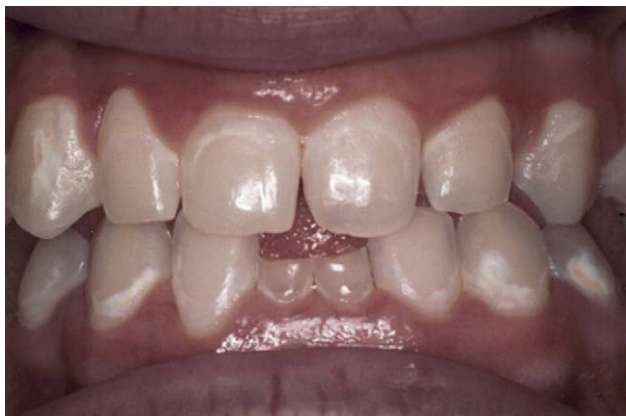
Fig. 1. Pretreatment frontal view.