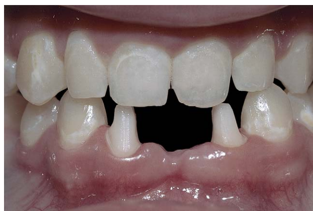
Fig. 4. Tooth preparation for 4-unit zirconia FPD.