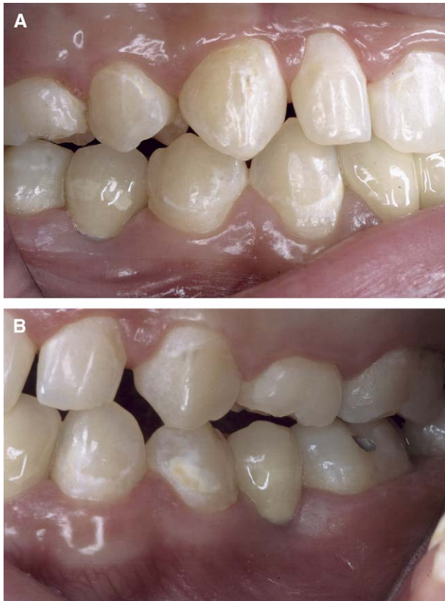
Fig. 7. A , Definitive prosthesis viewed from the right. B , Definitive prosthesis viewed from the left.

Procera; Nobel Biocare AB). The treatment in the maxillary arch was to be phased with the rest of the treatment due to financial constraints. Because the primary first molars had an acceptable root structure and were caries-free, treatment phasing was determined appropriate. The primary first molars would be retained and monitored until further treatment was deemed necessary.