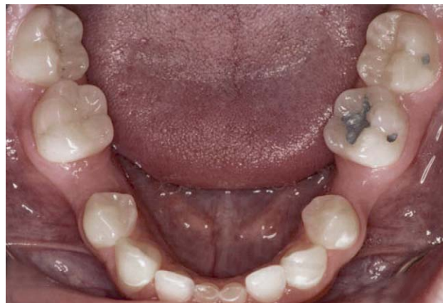
Fig. 2. Pretreatment mandibular occlusal view.