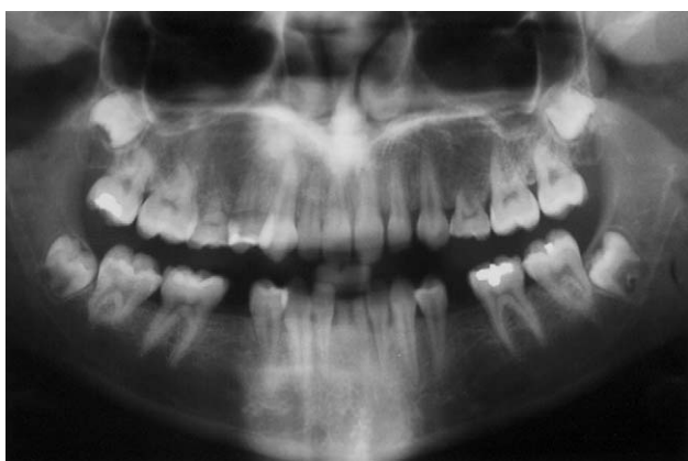
Fig. 3. Pretreatment panoramic radiograph.