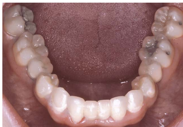
Fig. 6. Occlusal view of definitive prosthesis.

involving grafting of potential implant sites, treatment with a resin-bonded FPD, or use of removable prostheses to replace the missing teeth. Due to the limited bone width associated with the mandibular anterior edentulous region, an implant-supported restoration was not an option, even using a narrow-diameter implant.